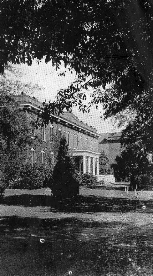
FERRING HALL—BOYS DORMITORY

Tifton is a beautiful little city with a population of approximately 8,000, located in one of the best farming sections of the South. Its beautiful homes, splendid churches and hospitable citizens make Tifton an exceptionally wholesome and attractive place in which to live.