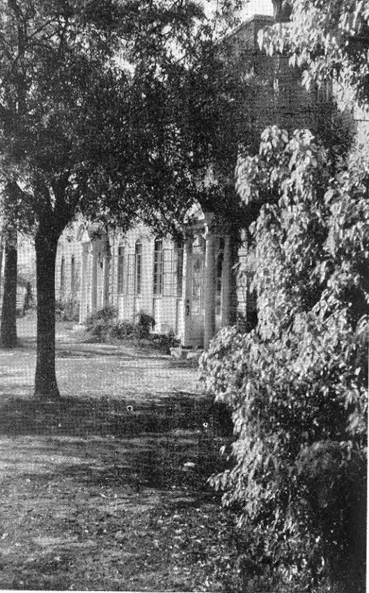
WELTNER HALL One of the Dormitories for Men

A Recognized College Abraham Baldwin Agricultural College is a unit of the University System of Georgia. Although training is given primarily for the farm and home, the young man or young woman wishing to continue in college after two years may enter other branches of the University System of Georgia teaching agriculture or home economics without loss of time or credit. That the college is recognized by patrons as being a desirable place to which to send sons and daughters may be seen from the enrollment figures, the total number of students attending having increased from 99 in 1933-34 to 445 in 1939-40.